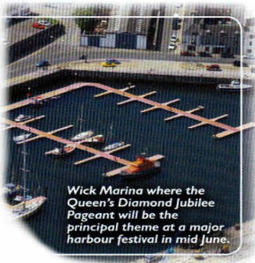
Wick Marina where the Queen's Diamond Jubilee Pageant will be the principal theme at a major harbour festival in mid June.

The feasibility study is expected to be completed by the end of the year, hopefully at the start of the Portsoy renaissance.